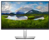
Dell 24 Monitor - P2422H

Stay productive no matter where you work with this sleek 23.5" FHD monitor with ComfortView Plus.