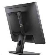
OptiPlex Micro All-in-One VESA Mount for E-Series Monitors with Base Extender

Versatile micro mounting solution for ideal use with Dell MSA20 or Dell MDA20 Monitor Arms.