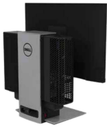
OptiPlex Small Form Factor All-in-One Stand - OSS21

Create a clean workspace for your Small Form Factor with integrated cable management and full range monitor adjustability.