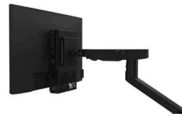
OptiPlex Micro Dual VESA Mount with Adapter Bracket

Adjustable, compact stand for your micro creates a clean, open workspace with minimal cables.