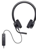
Dell Pro Stereo Headset - WH3022

Enhance your everyday productivity with a quiet full-size keyboard and mouse combo that offers programmable shortcuts and up to 36 months battery life.