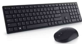
Dell Pro Wireless Keyboard and Mouse - KM5221W

Stay productive no matter where you work with this sleek 23.5" FHD monitor with ComfortView Plus.