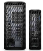
OptiPlex Tower and Small Form Factor Cable Covers

Experience clear conferencing and reduced background noise, with this intelligent MS Teams-certified soundbar.