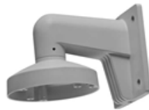
DS-1273ZJ-140 Wall Mount