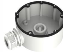
DS-1280ZJ-DM21 Junction Box